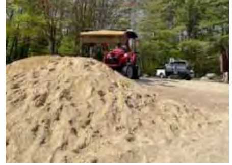
In 2022, Emerald Beach was refreshed with new sand.